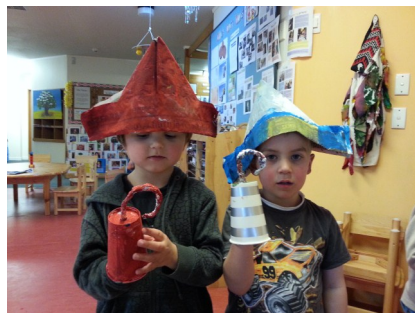
Are you pretending to be Captain Hook?

This is our 3rd newsletter of the year, and the Centre has been a hub of activity in the last few months. The children have been as busy as bees, exploring pirates, knights and animals. The teachers took notice of these interests through their planning meetings and observations, and have been coming up with exciting activities to encourage the children!