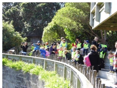
We are very lucky to see the lioness having a sun bath on a rock.

aids too. Following this, we recently planned a trip to the zoo to help extend all the children's interest in animals. This was also a great success and we say a big thank you to the parents who helped so much on the trip.