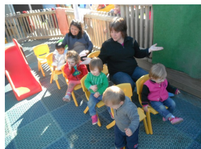
The Wheels on the Bus Go Round and Round...

The toddlers' interest (Pukeko Group) over the last couple of months has been in transportation. Our placement in the community has meant we have a bus stop next to our fence,