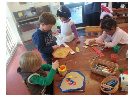
We are busy making armour with recycling materials.

We have incorporated pirates and knights in a lot of dramatic play. The children have been able to create their own armour, as well as hooks and pirate hats. They have also been exploring knights and pirates through literacy learning. We have been reading many stories set in the medieval times, and played games such as Pirates' Alphabet Hunt and Matching Words. The children have also been constructing their own castles! We have explored concepts of ICT with the children. They have been given many opportunities to view pictures of castles, knights, horses, carriages and princesses on the computer.